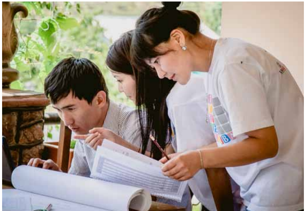
Students from the Jasa.kg Summer Business Leadership Camp in Koi Tash village, Kyrgyzstan, organized by the Bishkek Business Club, prepare to present their business plans to successful entrepreneurs and business leaders for their feedback.

The first PREPA grantee, selected in May 2013, is local NGO Unidos para Ajudar (UPA). UPA is targeting 700 youth in four peri-urban neighborhoods of Maputo (a high-prevalence province for HIV infection). All youth will